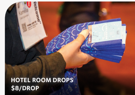
HOTEL ROOM DROPS $8/DROP

Host attendees for 2 hours, providing a free breakfast/lunch buffet and topic presentation by your KOLs *Food and beverage not included