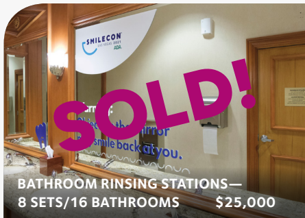
BATHROOM RINSING STATIONS— 8 SETS/16 BATHROOMS $25,000

YOUR name on every attendee tote bag. Includes a promotional insert provided by sponsor.