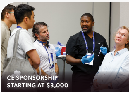
CE SPONSORSHIP STARTING AT $3,000

Get your message directly into the hands of attendees of select block hotels.