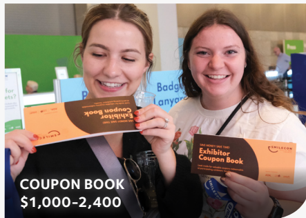
COUPON BOOK $1,000-2,400

Show your support for dentists and their teams by sponsoring CE—Presentations, Experiences & Conversations, and Hands-On Activities.