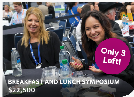
BREAKFAST AND LUNCH SYMPOSIUM $22,500

Sponsor mirror clings and your product for all to sample.