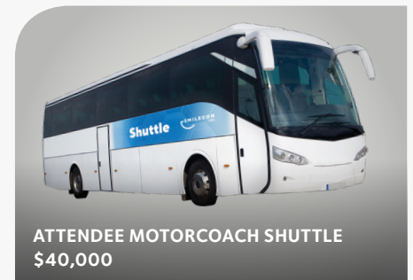
ATTENDEE MOTORCOACH SHUTTLE $40,000

Drive attendees to your booth with special offers or giveaways.