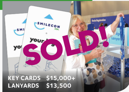
KEY CARDS $15,000+ LANYARDS $13,500

Check out Envision to see available opportunities.