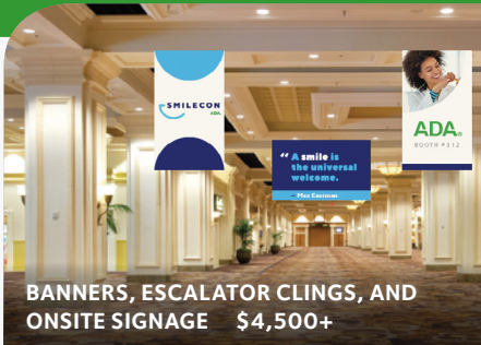
BANNERS, ESCALATOR CLINGS, AND ONSITE SIGNAGE $4,500+

Customize your package or choose from our à la carte items. SmileCon has a wealth of options!