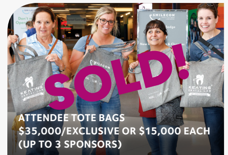
ATTENDEE TOTE BAGS $35,000/EXCLUSIVE OR $15,000 EACH (UP TO 3 SPONSORS)

Your logo and message on back of guest key cards and on attendee lanyards, each needed every day.