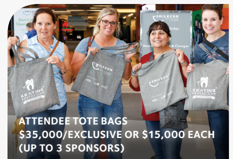
ATTENDEE TOTE BAGS $35,000/EXCLUSIVE OR $15,000 EACH (UP TO 3 SPONSORS)

Your logo and message on back of guest key cards and on attendee lanyards, each needed every day.