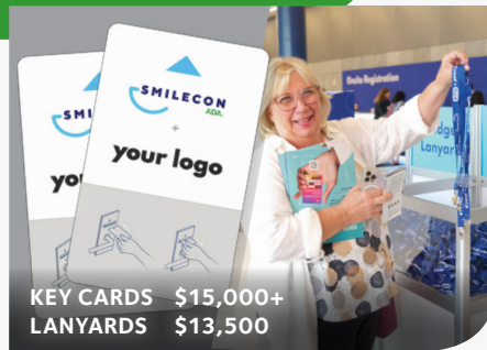
KEY CARDS $15,000+ LANYARDS $13,500

Check out Envision to see available opportunities.