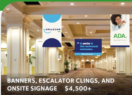
BANNERS, ESCALATOR CLINGS, AND ONSITE SIGNAGE $4,500+

Customize your package or choose from our à la carte items. SmileCon has a wealth of options!