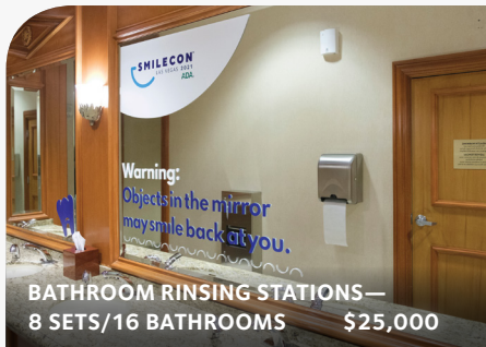
BATHROOM RINSING STATIONS— 8 SETS/16 BATHROOMS $25,000

YOUR name on every attendee tote bag. Includes a promotional insert provided by sponsor.