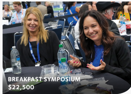
BREAKFAST SYMPOSIUM $22,500

Sponsor mirror clings and your product for all to sample.